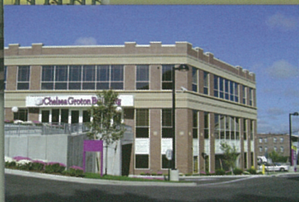
• Retail Facades